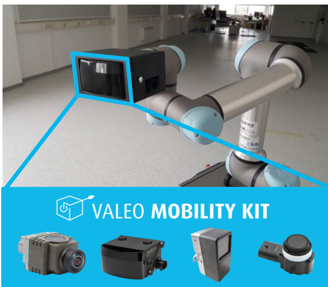
Cobot-HiL with the currently available sensors from Valeo's mobility kit: https://www.valeo.com/en/valeo-mobility-kit/ .

Valeo develops a Hardware-in-the-Loop (HiL) based on a collaborative robot (cobot) for automated perception tests of Valeo's mobility kit sensors including fisheye cameras, near- and far-field lidar sensors, and ultrasonic sensors. Mechanical safety features support the safety of the involved engineers.