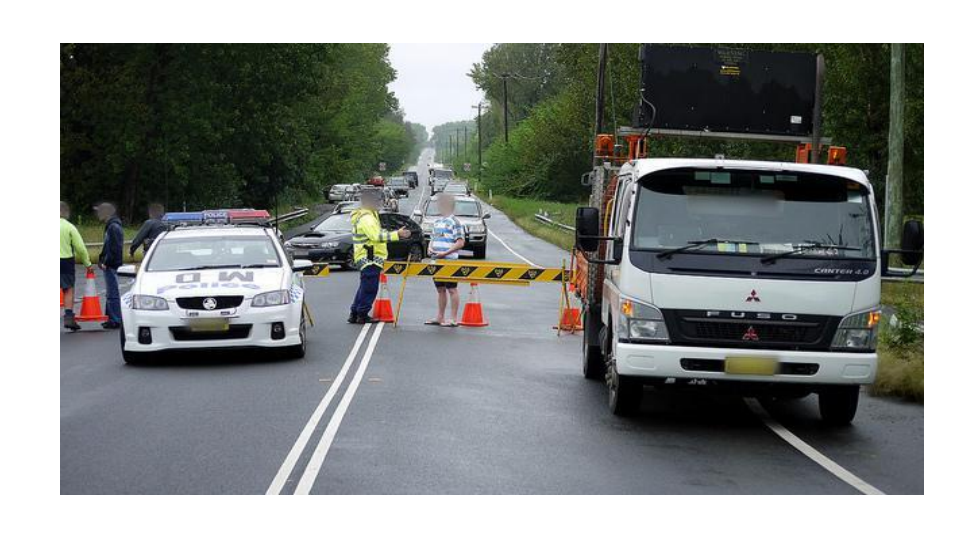
Fig.4 - Anonymized Data available for other project partners [2]

www.vvm-projekt.de Twitter @vvm-project LinkedIn VVM Project