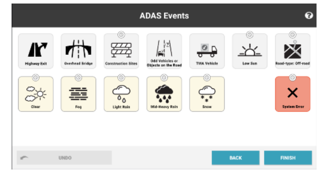
Fig.3.2 - AVL Digital Logbook – Event Tagging