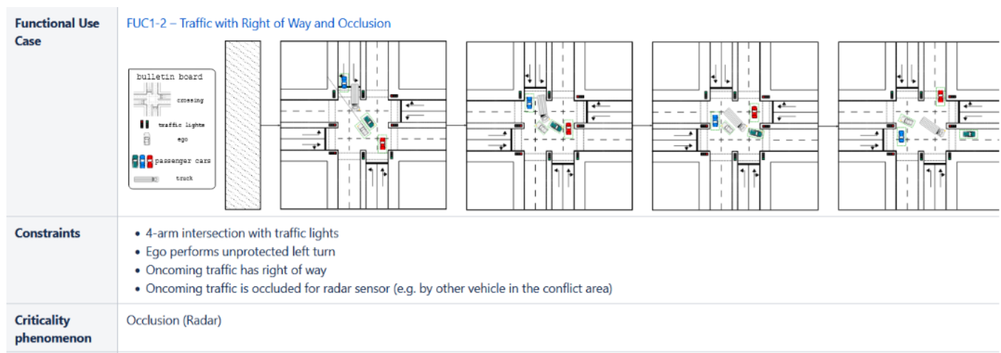
Fig.1 - Description of Functional Use Case for Test Drive Specification<sup>[1]</sup>

TP2 (Sub-Project) in VVM generates and provides a document relating to the critical scenarios to be captured in an urban environment. The document describes the functional scenarios using traffic.